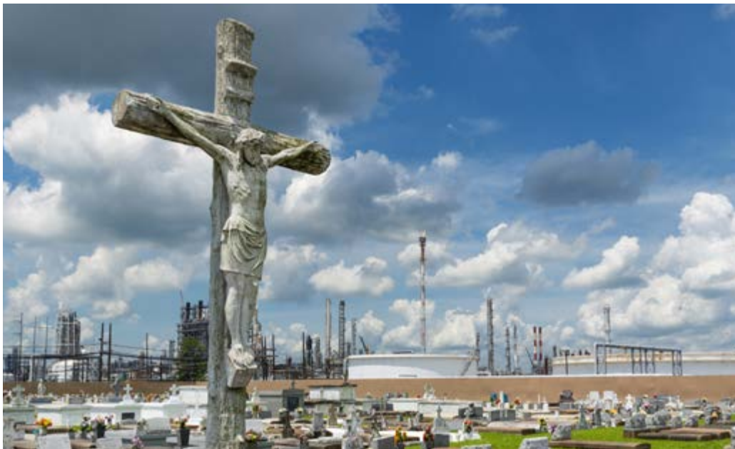
View of the Holy Rosary Cemetery in Taft, Louisiana, with a petrochemical plant on the background. The cemetery is located in the so called 'Cancer Alley'.

In addition to targeting marginalized communities, the multi-faceted petrochemical industry emits excessive quantities of greenhouse gases causing an acceleration of the global climate crisis.