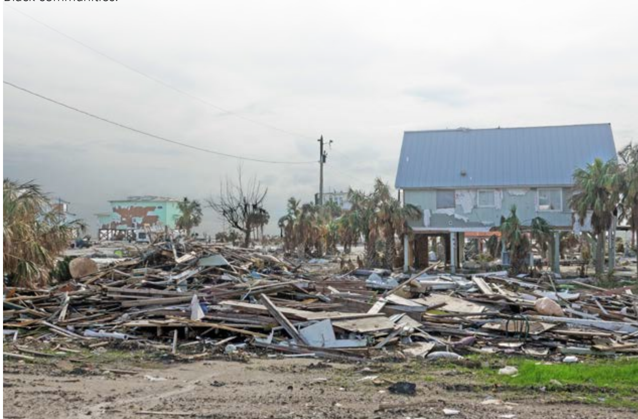
Debris and Destroyed Buildings on Gulf Coast in the Aftermath of Hurricane Michael.

By 2030, the number of flood events in the region will double, putting nearly 2 million homes at risk in just Florida and Texas alone. (24) Louisiana is experiencing one of the highest relative levels of land loss to sea level rise on the planet. (25) The acceleration of land loss is due to a deadly combination of oil and gas operations and engineered federal controls over the natural flow of the Mississippi River. Gulf Coast communities are significantly disadvantaged in preventing and recovering from flooding as a result of social and economic inequalities. The most impacted areas are host to long-standing tribal territories and historic Black communities.