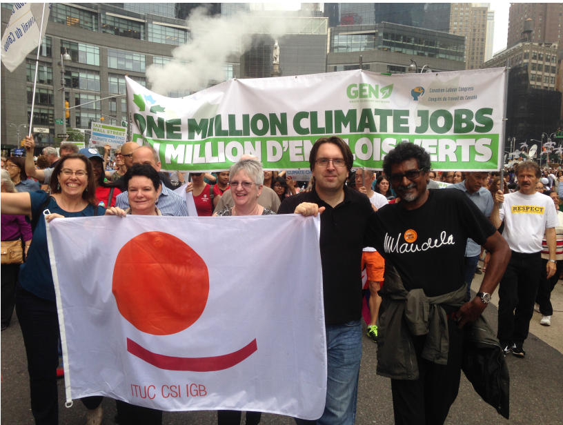
Canadian unions at New York climate march, 2014