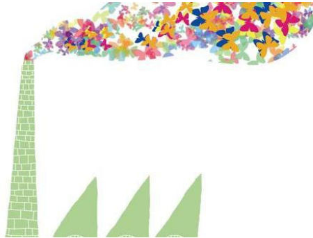
Norwegian climate jobs poster

This report is a work in progress. As our movement grows, we will revise it and add new case studies. If you want to get in touch with us, email globalclimatejobs@gmail.com