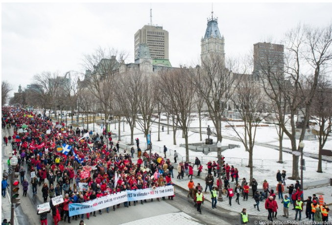
Quebec City climate march

Indeed, a good climate jobs strategy is imperative for developing an effective just transition for workers from a fossil fuelled industrial economy to a new low carbon economy of the future. Moreover, a collective focus on climate jobs provides real opportunities for cultivating new solidarities, not only between unionists and environmentalists, but uniting all people of good will, around a common purpose to build a new economy that is truly environmentally sustainable and economically equitable.