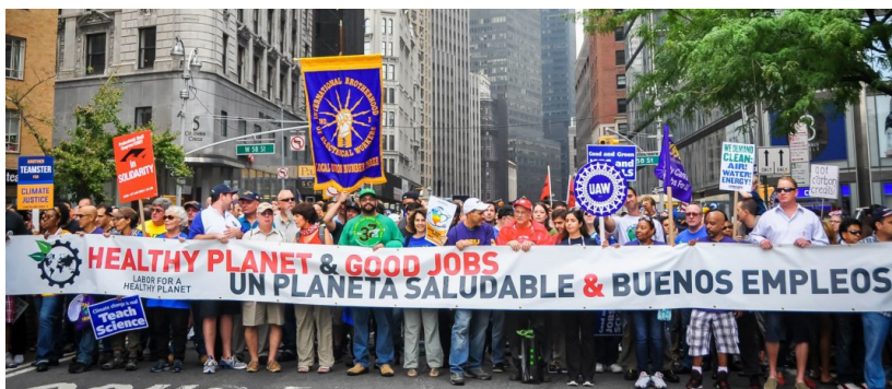
Unions on Peoples Climate March, New York, 2014

In 2014-2015, the New York labor movement and its allies in other movements launched two Climate Jobs initiatives. In New York City, Climate Works for All is a coalition of over 40 community, labor, environmental justice, faith and other organizations. And a New York State initiative, coordinated by The Worker Institute at Cornell, brings together unions in the building, energy and transport sectors to develop a comprehensive climate jobs plan for New York State.