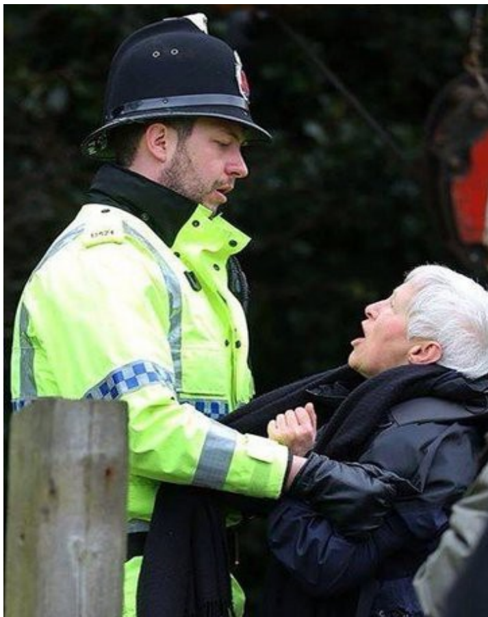
Anti-fracking protester, Manchester

Our story began in 2008 at a workshop in a conference organised by