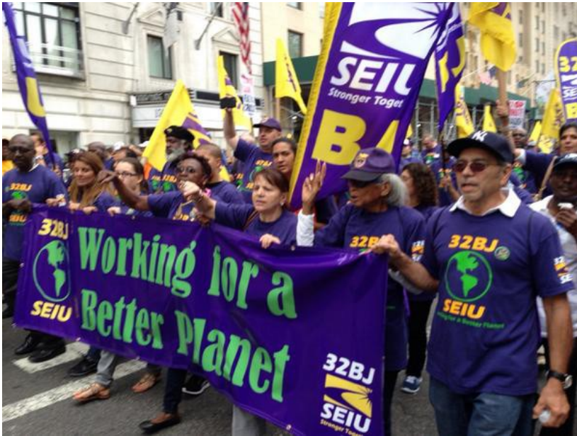
"The fight for the Earth starts today, BJ" - Service Employees International Union Local 32 BJ on the People's Climate March, New York, 2014