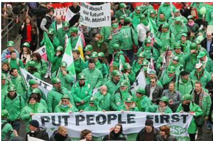
New York climate march, 2014