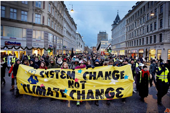
Copenhagen climate march, 2009

Of course, there will actually be a lot of innovation and inventions if we put 120 million people to work. However, there will also be some economic growth over 20 years. So in our calculations, we have assumed that inventions and growth will balance each other out.