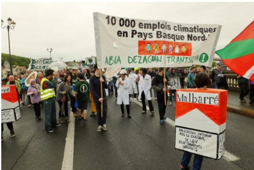
Climate jobs banner on Bayonne march, 2015

Mining and refining coal, oil and gas creates about 5 billion tons of greenhouse gas emissions. Most of that comes from refineries. But after 20 years we will only be using small amounts of these fossil fuels, mainly in aviation, shipping, making plastics and heating materials in industry. We won't need the rest. So we can cut emissions in this sector from 5 billion tons to 0.5 billion tons, simply because we will be mining and refining so much less. This is a cut of 90%.