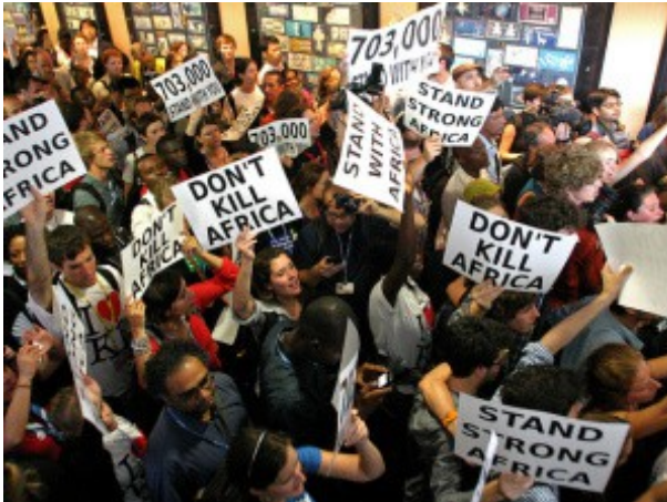
Protest, Durban climate talks, 2011

The One Million Climate Jobs Campaign was formed in 2011 as an alliance of labour, social movements, community organizations and environmental NGOs. It has been almost unique in being able to draw together such a diverse range of organizations, united around the two crises facing South Africa – climate change and extremely high unemployment. The campaign has developed well-researched solutions for how South Africa can immediately begin a just transition towards a low-carbon economy. By placing the interests of workers and the poor at the forefront of strategies to combat climate change, we can simultaneously halt climate change and address our job bloodbath.