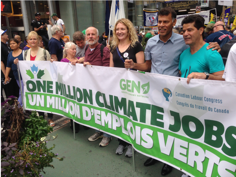
Canadian trade unionists, New York march, 2014

The movement for climate jobs and a new economy in Canada began in the run-up to COP 15 in Copenhagen in 2009. By that time, Canada was already receiving 'fossil-of-the-year' awards primarily because of the mega tar sands development in northern Alberta – labelled the 'world's fastest growing global warming machine.'