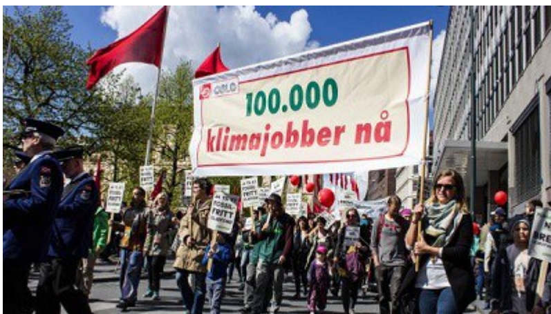
1 May 2015, Oslo

Climate jobs campaigns are growing in many countries for two reasons. First, in order to fight unemployment in an environmental sustainable way. And second, to secure a necessary transition from fossil fuel to renewable energy. In Norway, which, because of its “oil adventure”, has become one of the richest countries in the world, the unemployment rate has been very low for a long time – around 3 per cent. The focus of the Norwegian campaign has therefore been how to develop climate jobs in order to put a brake on, or cool down , oil and gas.