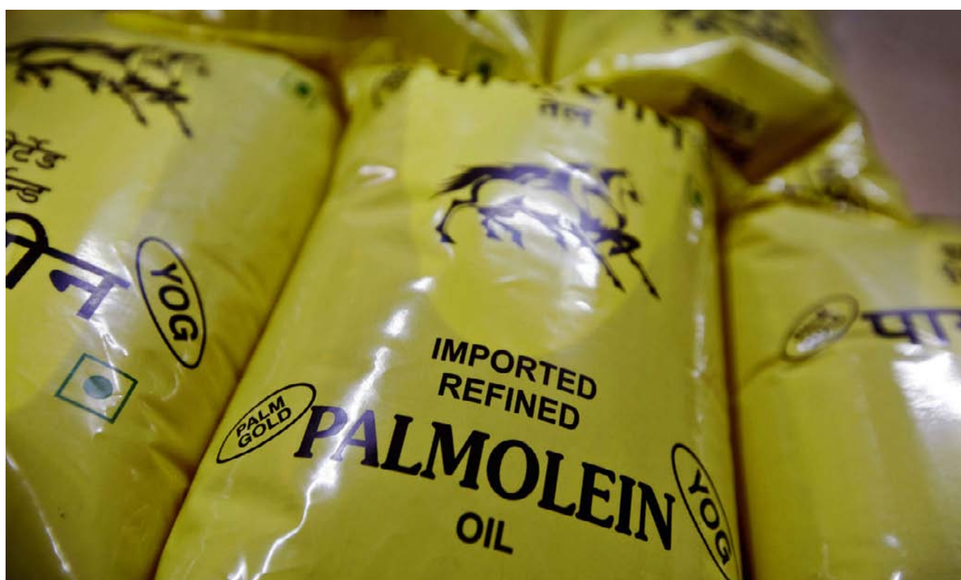
Bags of imported palmolein oil are stored at a warehouse of a cooking oil wholesaler in Mumbai.

The communities living on the lands are an afterthought, a potential obstacle to the money making. But they are the ones who ultimately pay the price.